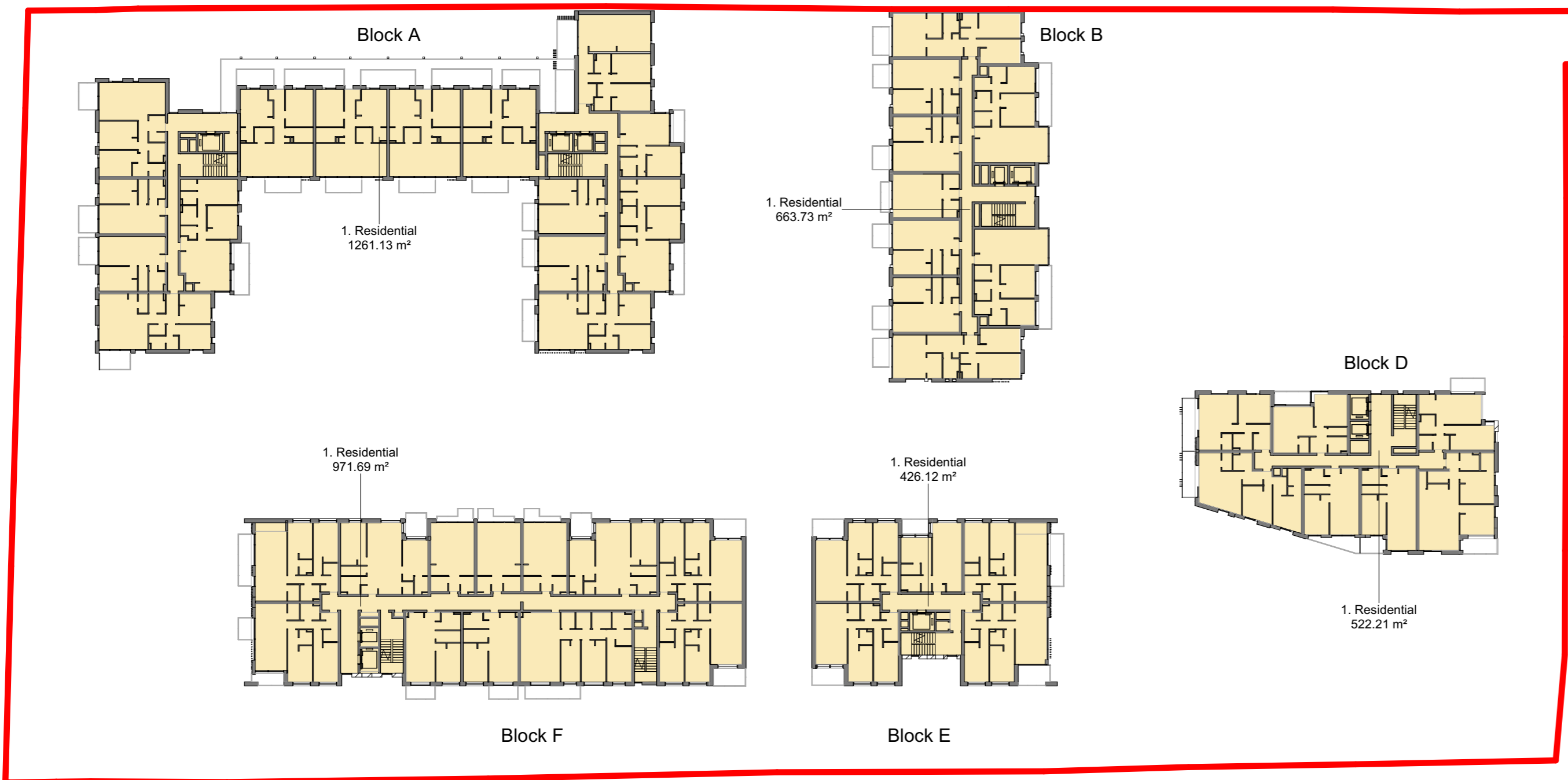
1 08 - EIGHTH FLOOR 1:500