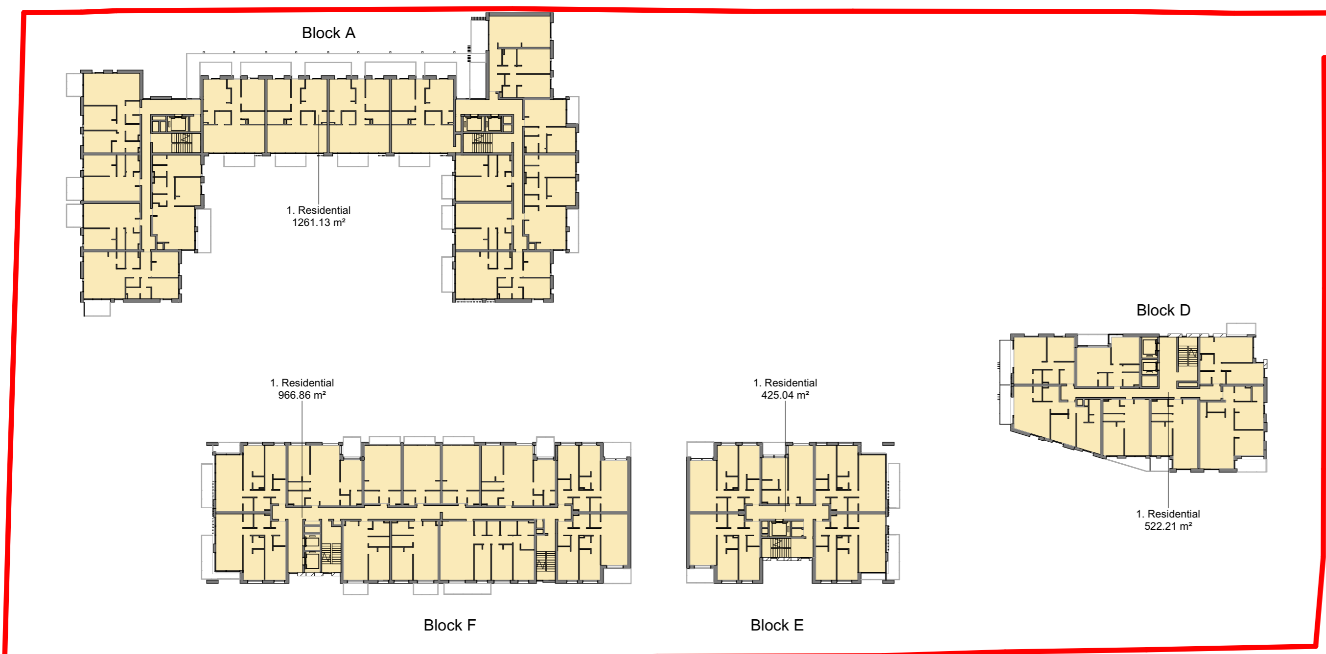
3 10 - TENTH FLOOR 1:500